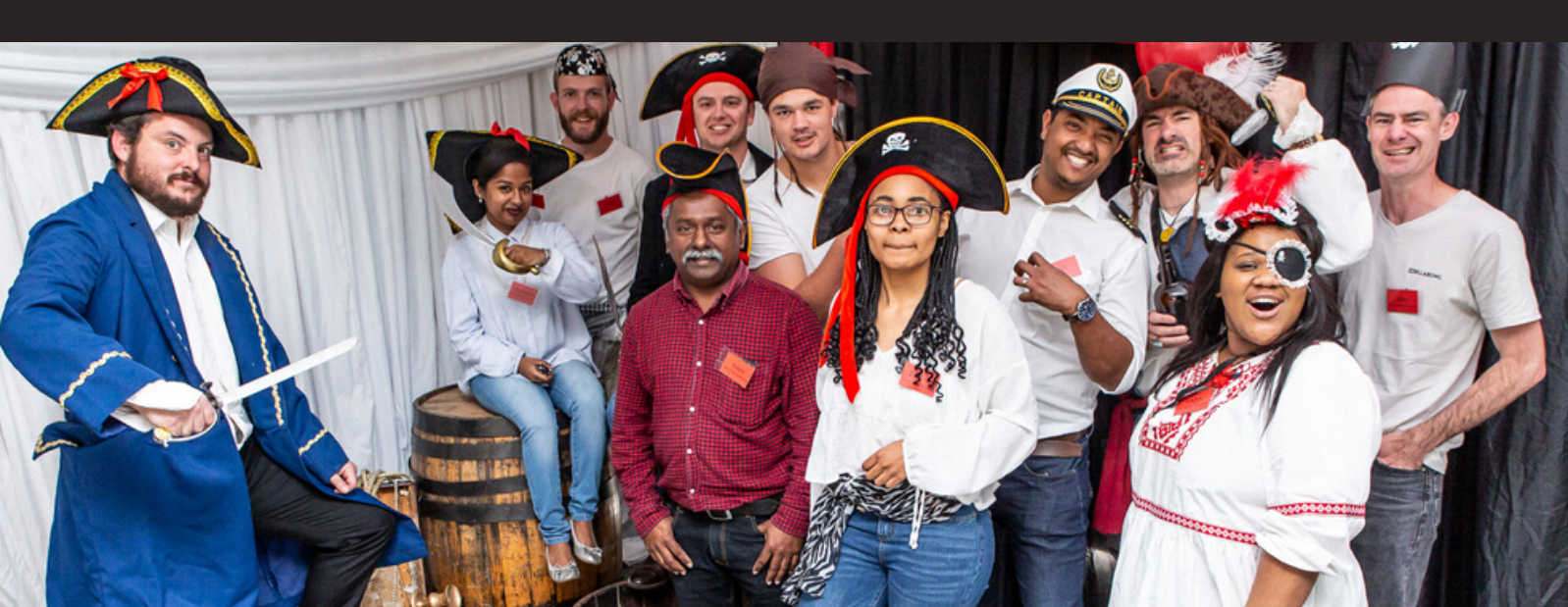
DAVEY JONES' LOCKER (PIRATE)