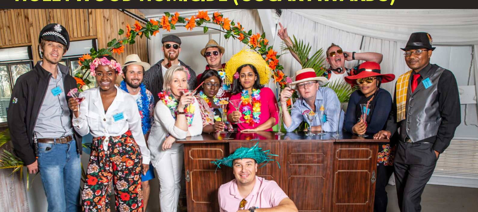
CARIBBEAN COCKTAIL CRIME SCENE (ISLAND)