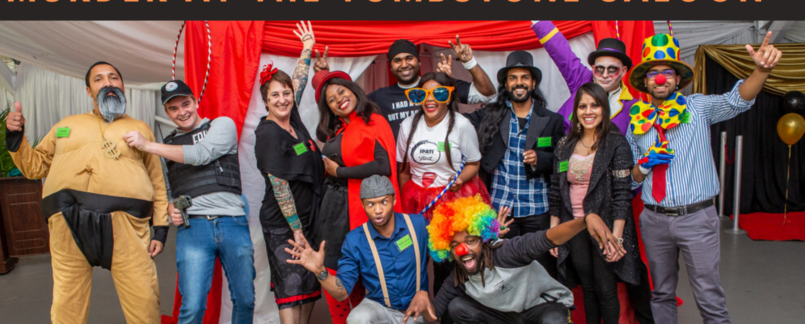
THE THREE CORPSE CIRCUS MYSTERY