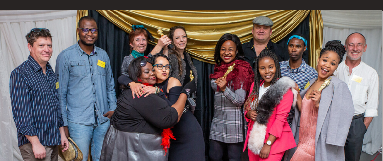
HOLLYWOOD HOMICIDE (OSCAR AWARDS)