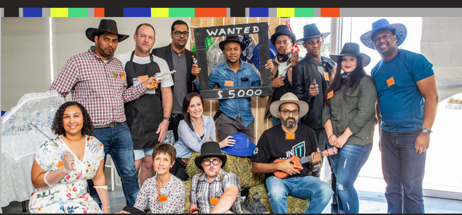
MURDER AT THE TOMBSTONE SALOON